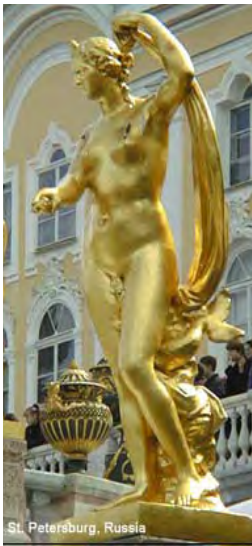
St. Petersburg, Russia