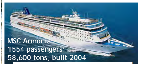
MSC Armonia 1554 passengers; 58,600 tons; built 2004